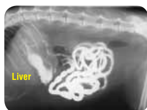
Abdominal radiograph of a cat. Barium outlines the stomach and intestines