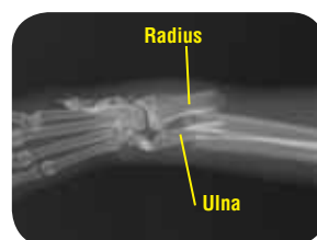
Radiograph of a dog with a fractured forelimb involving both radius and ulna bones.