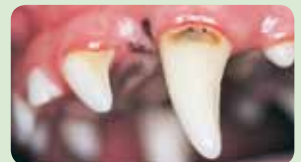
(2) Gingivitis – with early calculus