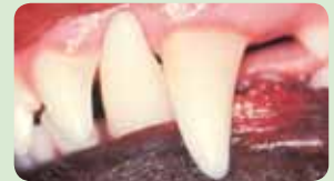
(1) Healthy mouth