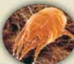
Electron micrograph of the ear mite – Otodectes cynotis