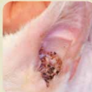
Otitis externa in a cat with ear mites ( Otodectes cynotis ). The photo shows the characteristic crusty brown discharge in the external ear canal